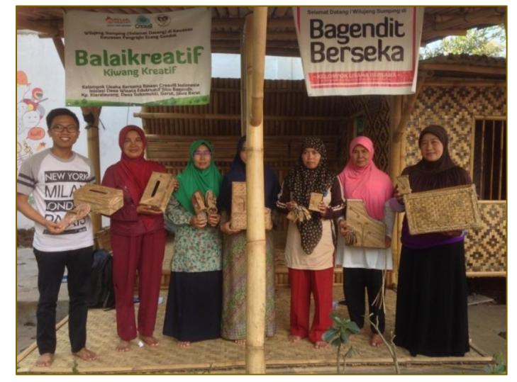
Figure 4. Physical Evidence of Kiwang Kreatif Craft's Gallery in Garut District

The last factor in marketing mix analysis is the physical evidence. In general, physical evidence is the evidence or physical elements that influence the customer to value the company. Physical evidence can help create the environment where the service can be bought or create the product Picture to the customer (Kotler & Keller, 2009). KKC has a workshop and gallery in Kialarawang town and now they have 13 members and craftsmen.