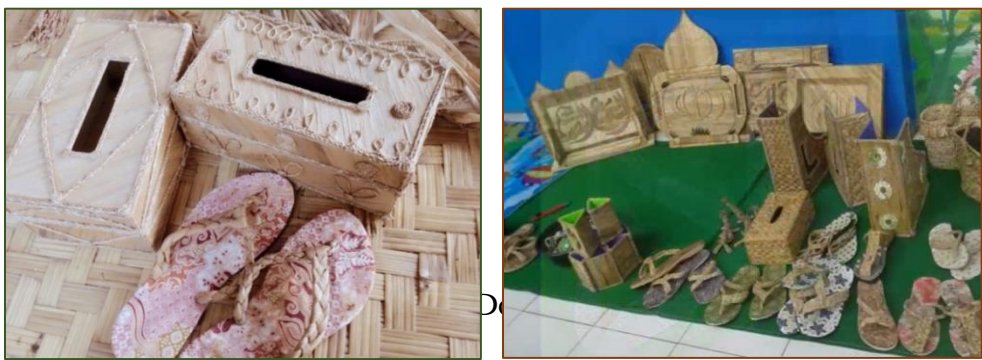
Figure 3. Sample Products of Kiwang Kreatif Craft

KKC used cost-based pricing on its marketing strategy. The foundation in pricing strategy are cost, competitor, and the value for the customer. The major for pricing strategy is divided by Cost-Bases Pricing and Value-Based Pricing. Cost based strategy is setting price with consideration of cost like production, selling, and distribution cost, while VBS is using buyer perception of value to determine the price (Lovelock & Wirtz, 2011). KKC often adjusting it's price based on the cost its spend. Price of the products can be change, either it goes higher or lower, based on raw material's price (glue, varnish, etc.). The price of products starts from Rp. 2.000 as the cheapest one to Rp. 300.000 as the most expensive one. However, an average price is at RP.40.000 to Rp.75.000. Meanwhile, others competitor has higher prices (Table 2).