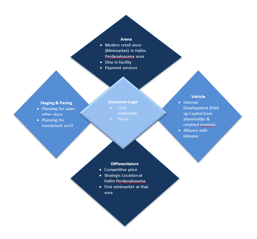
Figure 3 New Strategy Diamond Model of Permata 68