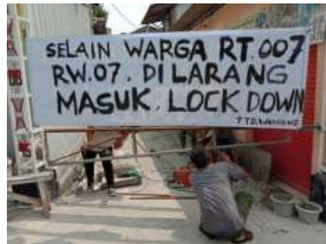
Figure 2. Tactical Urbanism in Urban Kampong (1)

Urban Kampong is a unique and sporadic settlement in Indonesia which is applying togetherness in everyday life. As part of informal settlement, several urban kampongs have limited infrastructure, high-density building, crowded activities due to the sharing space for work and domestic activities in the street alley, and engender urban kampong as a vulnerable place for spreading viruses in the pandemic. In the first implementation of PSBB in 2020, several kampongs responded to this regulation reactively. Several kampongs were locking the main entrance from outsiders. They used portal, banner, fencing their settlement for lockdown reason. They used banner and speaker to remind people of physical distancing, wear the mask, and wash the hands. They used non-fix material such as bamboo to fortify their territory from the outsider. Some kampongs use security space ( gardu pos ) as a checkpoint for non-inhabitant to enter the kampong. So that peddlers and online motorcycle taxis cannot enter any kampongs anytime. They put portable handwash near the gate of the kampong. Some people take turns guarding the main entrance to diminish the influx of non-resident. To reduce boredom and to improve health, sometimes they do sport together in the street alley. People in kampong create a temporary adaptation for pandemic using low cost and non-fix material to cut guests pass in kampong territory. They applied simple and spontaneous tactical urbanism to reduce the virus COVID-19 spreading.