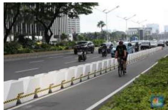
Figure 6. Tactical Urbanism for Bicycle Lanes in Jakarta (2)