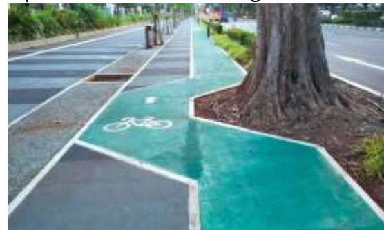
Figure 5. Tactical Urbanism for Bicycle Lanes in Jakarta (1)

several places, such as in Sudirman Street. So, in the Jakarta case, the government uses tactical urbanism to support bike lanes in main road or pedestrian ways by separation or colour. See Figure 5.