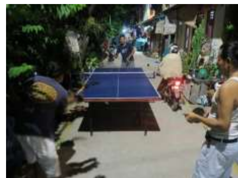
Figure 3. Tactical Urbanism in Urban Kampong (2)