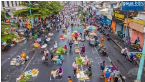
Figure 4. The Tactical Urbanism in the Morning Market in Salatiga City, Indonesia

place themselves in the provided space. This arrangement does not disturb the traffic due to this morning market open daily from midnight until 06.00 AM. This procedure was first applied on April 27 2020, as the local government respond to