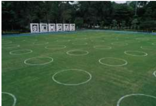
Figure 7. Tactical Urbanism in Sempur Park

stickers, masking tape, and place warning sign in public bench, queue line, place of prayer ( sholat ) in the mosque, and even drive-in concert. Absolutely, tactical urbanism is only a tool for arranging people to behave well in a pandemic era suitable with health protocol. But, without supervision and sanctions, sometimes it is easy to break the rule.