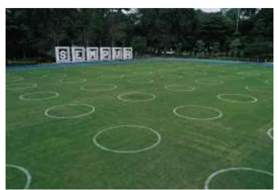
Figure 7. Tactical Urbanism in Sempur Park

stickers, masking tape, and place warning sign in public bench, queue line, place of prayer (sholat) in the mosque, and even drive-in concert. Absolutely, tactical urbanism is only a tool for arranging people to behave well in a pandemic era suitable with health protocol. But, without supervision and sanctions, sometimes it is easy to break the rule.