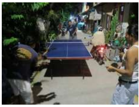
Figure 3. Tactical Urbanism in Urban Kampong (2)