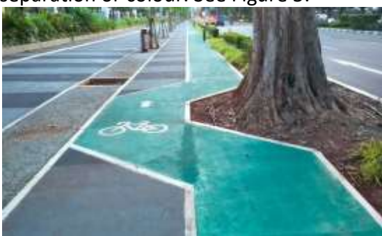
Figure 5. Tactical Urbanism for Bicycle Lanes in Jakarta (1)

several places, such as in Sudirman Street. So, in the Jakarta case, the government uses tactical urbanism to support bike lanes in main road or pedestrian ways by separation or colour. See Figure 5.