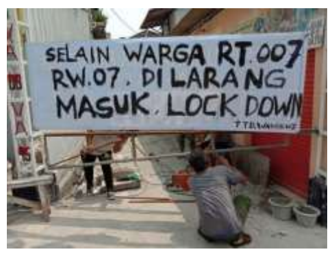
Figure 2. Tactical Urbanism in Urban Kampong (1)

They put portable handwash near the gate of the kampong. Some people take turns guarding the main entrance to diminish the influx of non-resident. To reduce boredom and to improve health, sometimes they do sport together in the street alley. People in kampong create a temporary adaptation for pandemic using low cost and non-fix material to cut guests pass in kampong territory. They applied simple and spontaneous tactical urbanism to reduce the virus COVID-19 spreading.